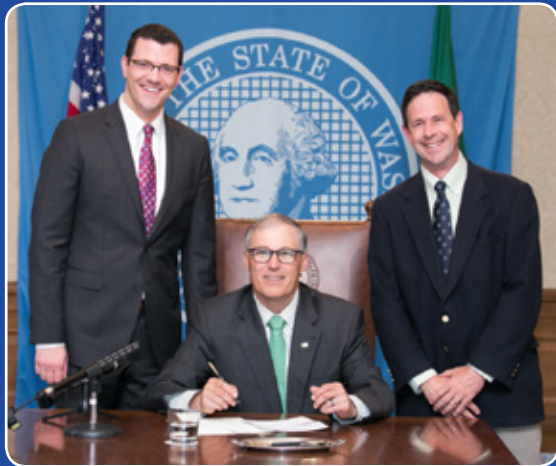
GOVERNOR JAY INSLEE (D), SIGNING SUBSTITUTE HOUSE BILL 1184 INTO LAW ON APRIL 24, 2015.